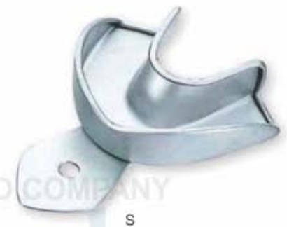
DE-1749 SET OF 06 PCS Upper: S, M, L Lower: S, M, L