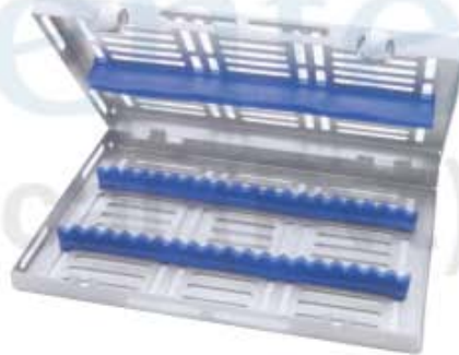
DE-1800 288 x 182 x 35 mm 20 Instruments