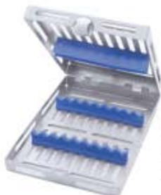
DE-1803 182 x 145 x 35 mm 9 Instruments