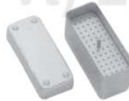
DE-1840 Endodontic Box