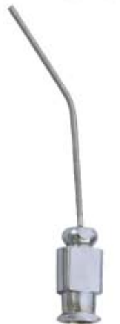
DE-1925 Suction Needle 1mm