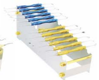
DE-1805 Sinus Lift Set Stand