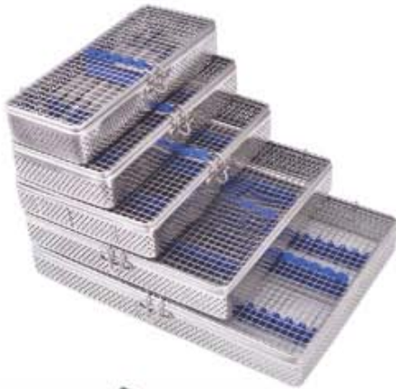
DE-1793 Mesh Cassettes 5 Pieces, 7 Pieces, 10 Pieces, 15 Pieces & 20 Pieces