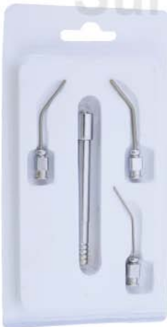
DE-1923 Suction Cannula Kit with 3 Needles