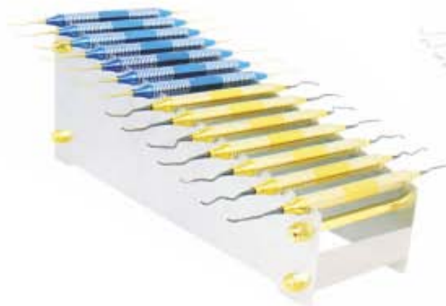
DE-1804 Gracey Curette Set Stand