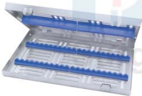
DE-1799 288 x 182 x 35 mm 20 Instruments