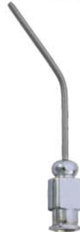
DE-1926 Suction Needle 1.5mm