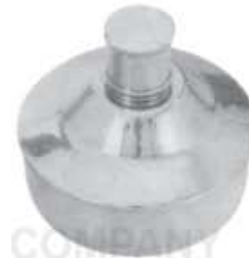
DE-1913 Sprit Lamp