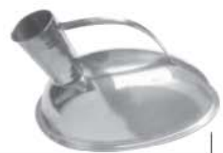
DE-1917 Urinal Female, Urinal Male, Urinal Male Vertical