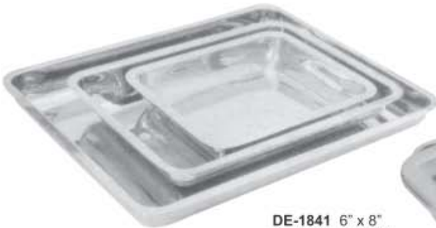
DE-1841 6" x 8" DE-1842 8" x 10" DE-1843 10" x 12" Without Lid