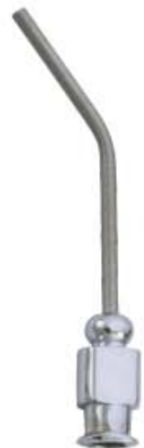
DE-1927 Suction Needle 2mm