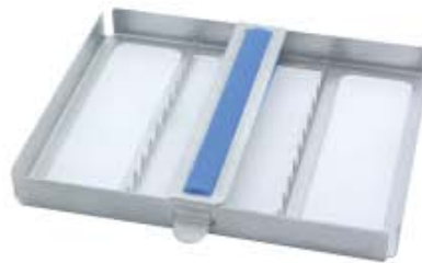
DE-1797 182 x 150 x 20 mm 10 Instruments