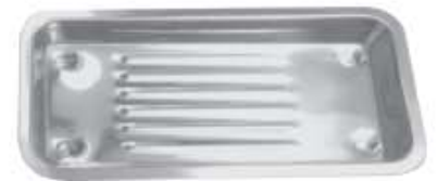
SCALER TRAY DE-1845 100 x 200 mm