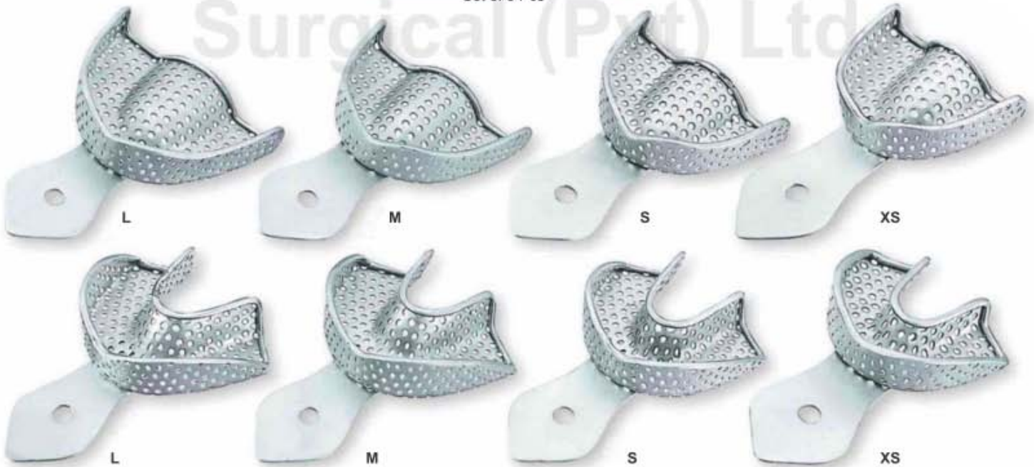
DE-1746 SET OF 08 PCS Upper: XS, S, M, L Lower: XS, S, M, L