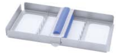
DE-1798 180 x 85 x 15 mm 5 Instruments