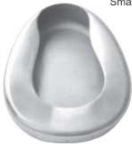
DE-1916 Bedpan Perfection Type Small & Large