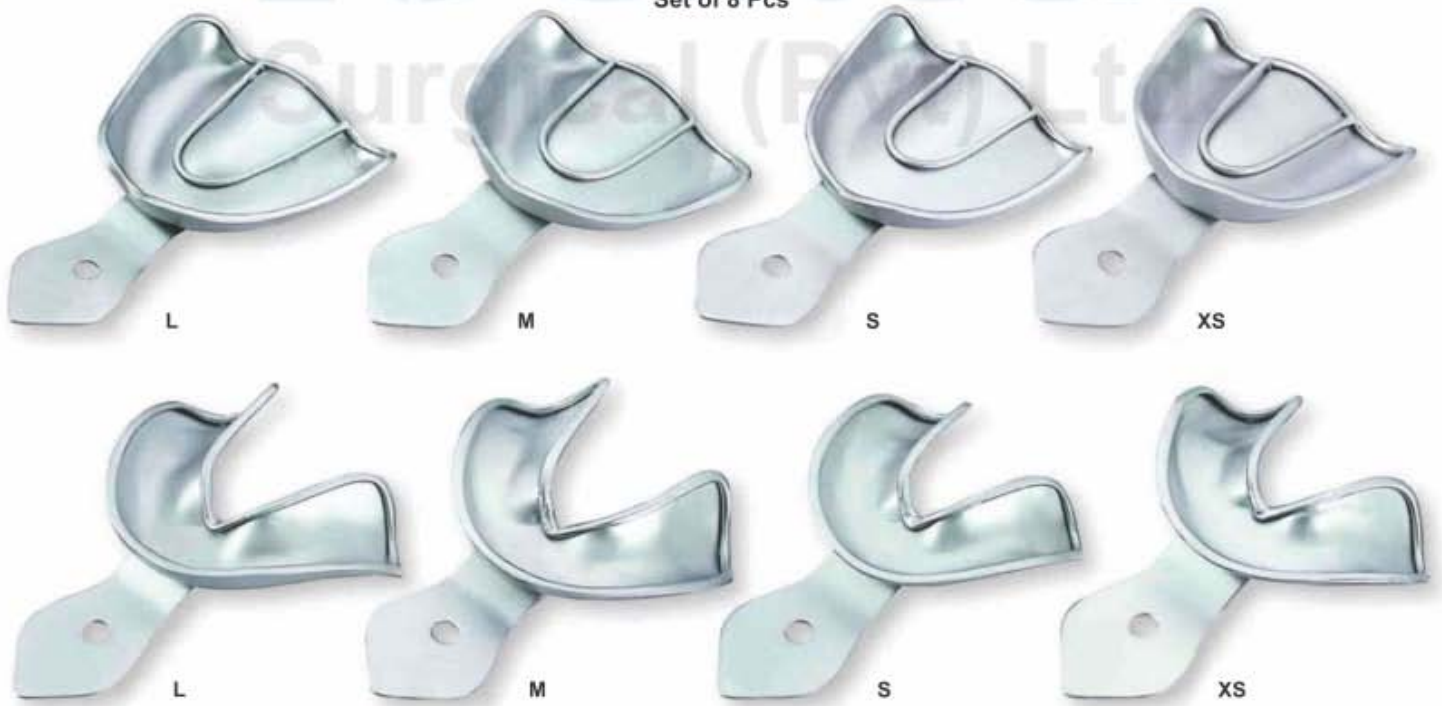
DE-1755 SET OF 08 PCS Upper: S, M, L, XL Lower: S, M, L, XL