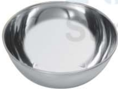
Bowl DE-1839 Fig. 1 to 14