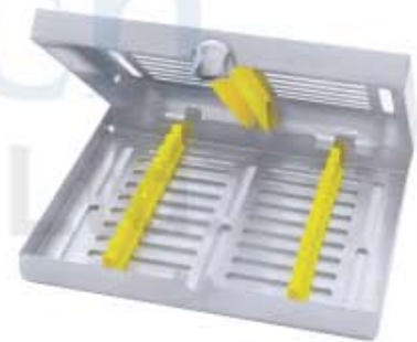
DE-1801 182 x 145 x 35 mm 10 Instruments