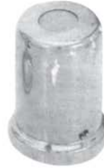
Cotton Holder - DE-1911