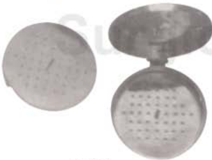
DE-1914 Endodontic Box Small & Large