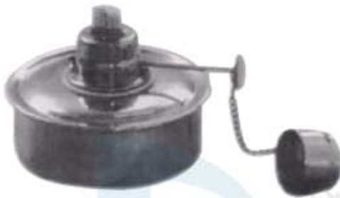
DE-1912 Sprit Lamp Single Nut