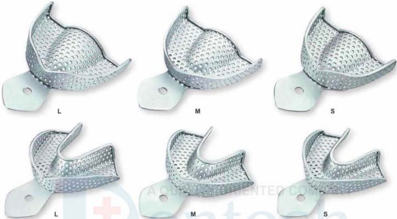
DE-1745 SET OF 06 PCS Upper: S, M, L Lower: S, M, L