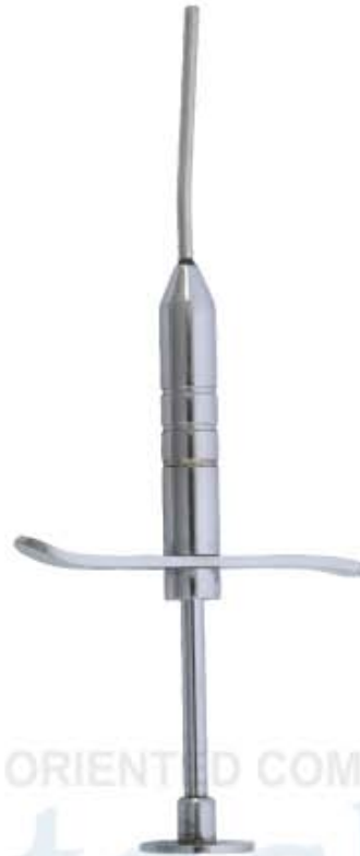
DE-1921 Amalgam Gun