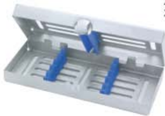
DE-1802 182 x 72 x 35 mm 5 Instruments