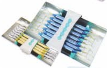
DE-1796 Gracey Curette Set Cassettes