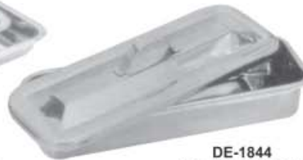
DE-1844 Instruments Box