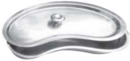
KIDNEY TRAY WITH COVER (English Pattern)