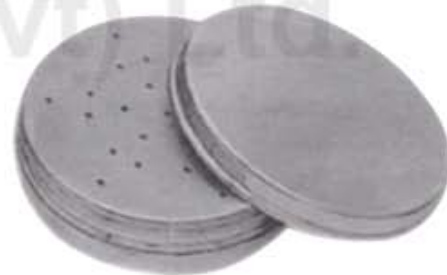
DE-1915 Needle Case Round with Cover